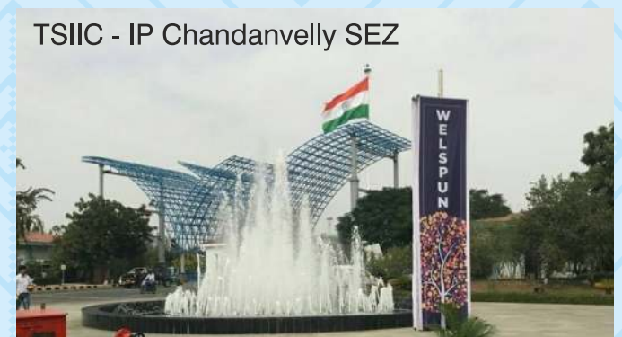
TSIIC - IP Chandanvelly SEZ