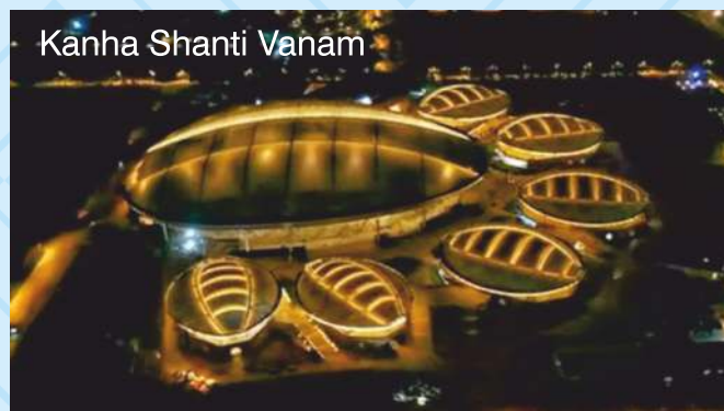
Kanha Shanti Vanam